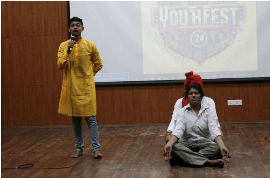
Drama by Drama club