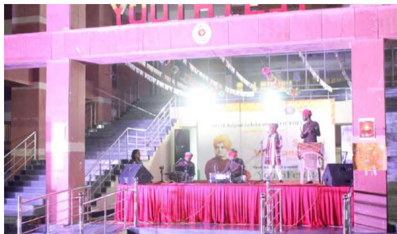
Lohri Celebration and Folk Night