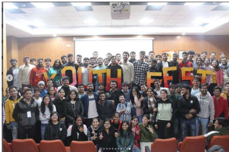
Student Organizing Team with Volunteers and Audience