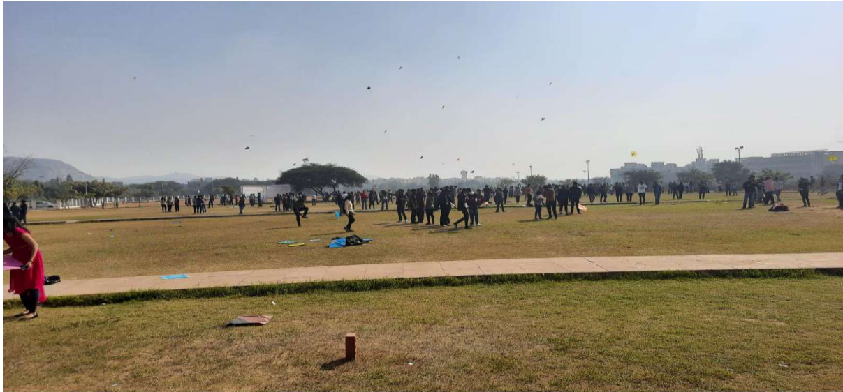
Kai Po Che

The third day of Youthfest 2024 started off with a variety of enthusiastic events. The Makar Sankranti celebration started with the event named “ Kai Po Che ”, where the students of MNIT enjoyed flying kites at OAT. Meanwhile, some other zealous parallel events were organized at MNIT Sports Ground. Some of those were Tug of war, Cricket.