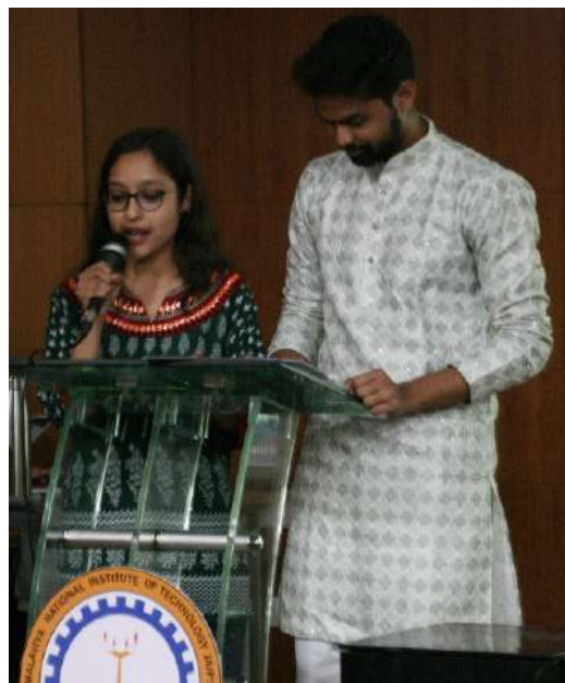
Inauguration of YouthFest-24