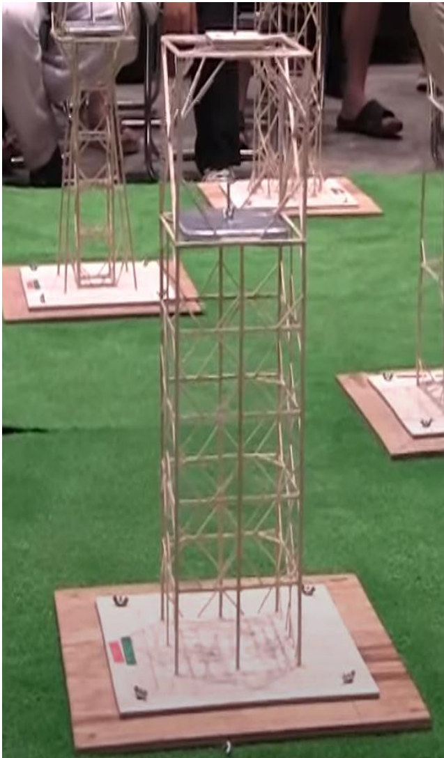
Example of stick structure to be built.

The structures to be built will not be as complicated and tall as shown in this video. This video just explains how the event will proceed.