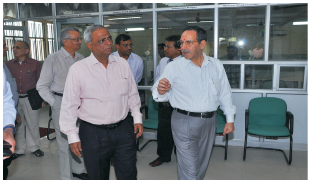
Director with guests at the Learning Resource Center

❖ The Malaviya National Institute of Technology inaugurated an advanced and well-equipped library under the name of 'LEARNING RESOURCE CENTER' on April 13, 2012 . The Inaugural ceremony was graced by the