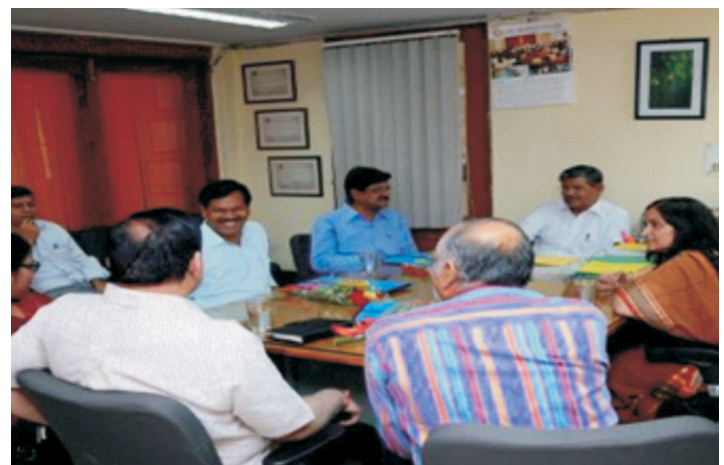
Participants interacting at the workshop in SPA, New Delhi

❖ A committee from the Institute of Town Planners India visited the Department of Architecture and Planning in the first week of May. The visit was organized in order to get the post-graduate course in Urban Planning run by the Department, approved by ITPI. The committee inspected the facilities and