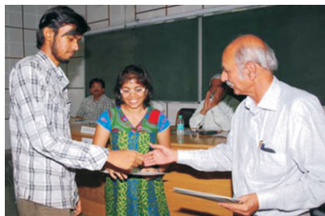
Students receiving awards

from all over India. The participants were selected from around 120 applicants.