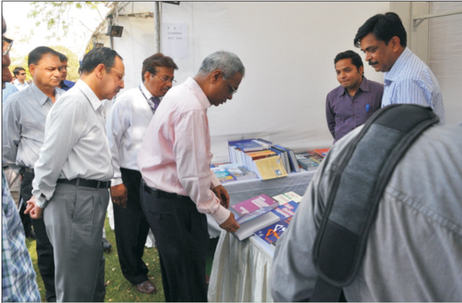
Distinguished Guests at the Book Exhibition

presence of Dr. Anil Kakodkar . A three-day mega Book Exhibition also kick-started with the inauguration of the Library. The Learning Resource Center has been designed keeping in view the needs of the students and faculty members. The center has eight air- conditioned reading areas, along with a couple of stack areas, where a wide variety of engineering and non-engineering books are available. The center provides a 24-hour reading facility for students and is under surveillance round the clock.