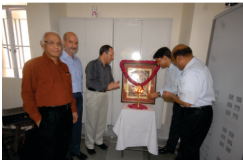
Inauguration of SDEE laboratory