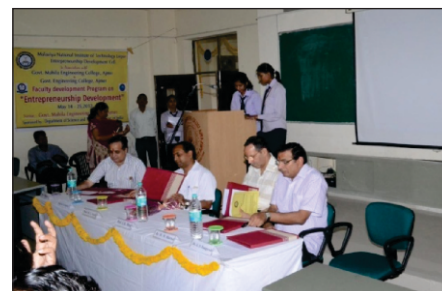
Inaugural Ceremony of Faculty Development Programme