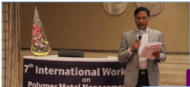
Expert delivering a lecture at the Seventh International Workshop on Polymer Metal Nanocomposites