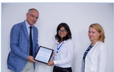
DAAD Young Ambassadorship at German Embassy New Delhi

T he German Academic Exchange Service or DAAD is the largest German support organisation in the field of international academic co-operation.