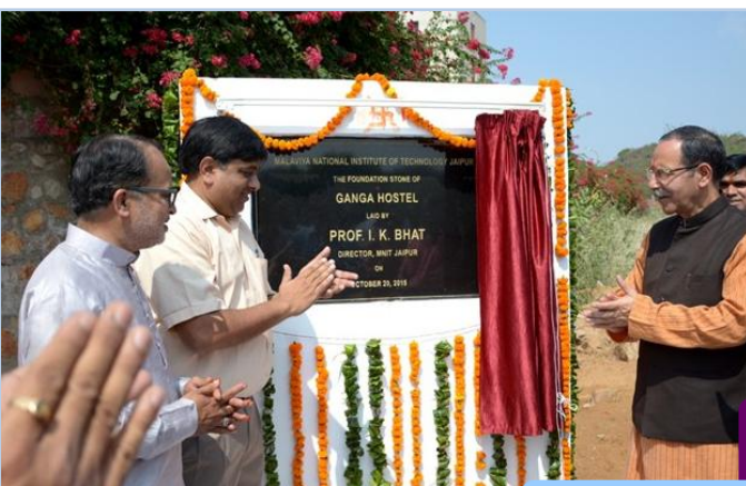
Foundation Stone laying of Ganga Girls Hostel