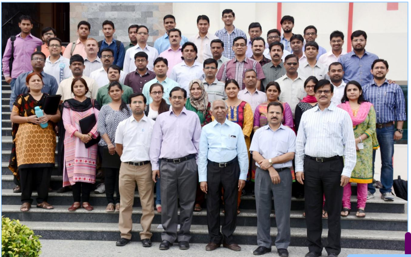
STTP on Research Methodology: Participants and Coordinators