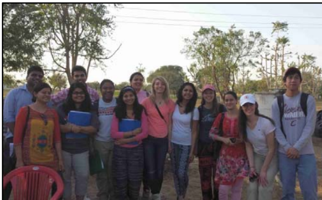
Illinois and MNIT students pose for a photo after conducting fieldwork in Sikar District.