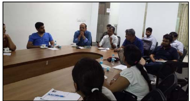
MNIT faculty and NGO partners provide feedback at the team's final presentation.